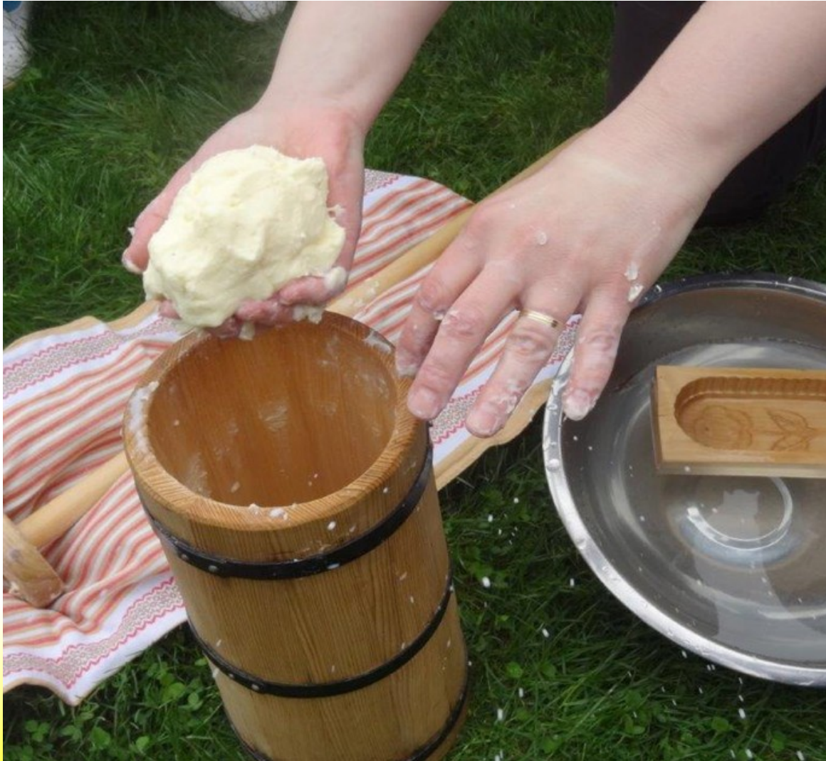
Handicraft butter production in traditional wooden molds